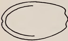
Figure 2. Outline of air bladder from a ventral view; anterior end to the right. Female.

females this structure is more or less heart-shaped from a ventral view (Figure 2), but in the five males (the largest specimens) a prominent posterior projection (Figure 3) is developed. This protrusion is hollow and covered by a membrane at the distal end. Furthermore, this membrane is very elastic and presumably can extend a considerable distance into the coelomic cavity when pressure is exerted upon the comparatively rigid air bladder. Harry (1951: 32) first called attention to the widespread occurrence of this type of sexual dimorphism in the Ophidiidae. Its discovery in this species serves to further indicate it may be a fundamental characteristic of the entire family.